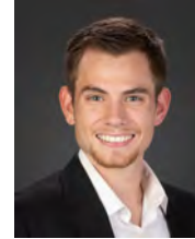
Mark Pinson Index Production and Analysis

The municipal bond market, as measured by the Standard & Poor's Municipal Bond Investment Grade Index, had a Total Return of 2.303% in December 2023, consisting of the components displayed in Table 1.